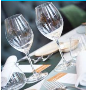
"VINO" WINE PACKAGE