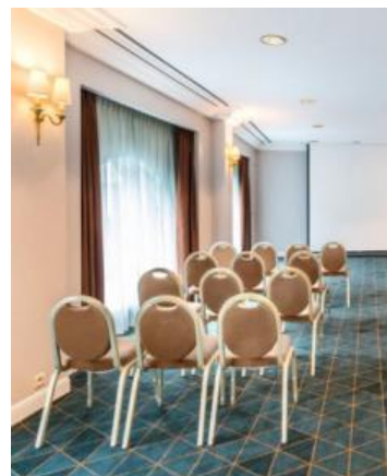
GRAND PLACE PACKAGE