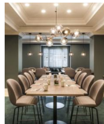
MENU AT ALBA