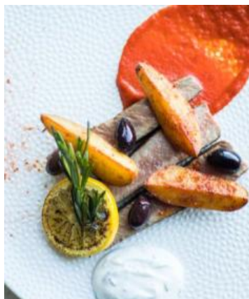
CHEF'S SIGNATURE MENU