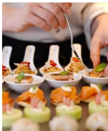
BUSINESS LUNCH TRAY