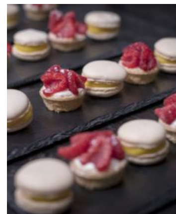
GRAND PLACE BUFFET