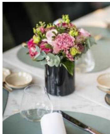
MENU AT SENTRO