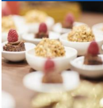
A LA CARTE SELECTION